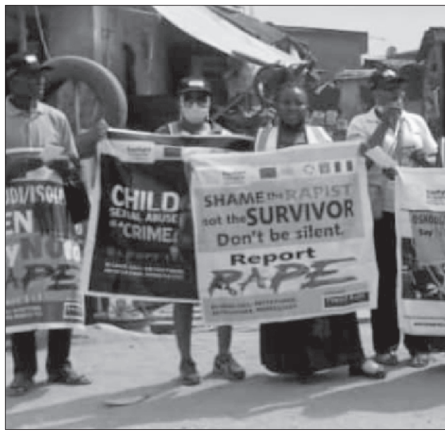
Sensitization Programme against domestic violence

He implored the community members to always speak out and call for help if they find themselves in any of the violent situation for quick action to be taken, stressing that the alarming crisis has to be eradicated from human society.